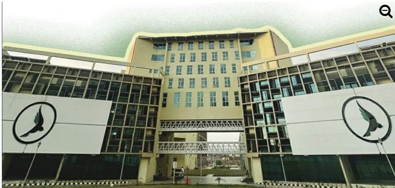
IIM Ranchi

To provide a multidisciplinary programme which could bring a positive change to the lives of the students, elective courses called Enrichment Electives have been introduced across all the first three years of the Integrated Programme in Management (IPM) at the Indian Institute of Management (IIM), Ranchi, giving an opportunity for its students to learn a local tribal language in the language elective course scheduled in the second year, stated a report in The New Indian Express .