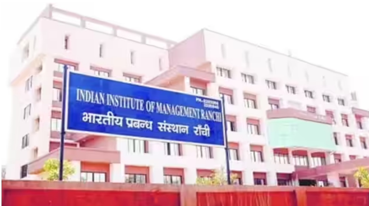
Indian Institute of Management, Ranchi (File Photo)