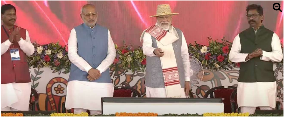
During campus inauguration

The Indian Institute of Management (IIM) Ranchi was inaugurated by Prime Minister, Shri Narendra Modi on November 15, Wednesday.