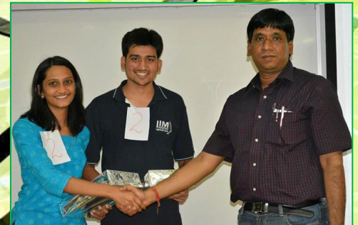
Rashtriya Ekta Diwas