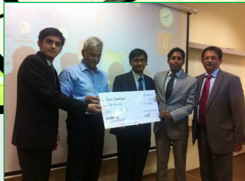
IIMR Hosts RPG Blizzard