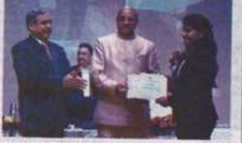
Governor Ramesh Bais presents a certificate to a student during the Foundation Day celebration at Indian Institute of Management Ranchi (IIM Ranchi) in Ranchi on Wednesday.