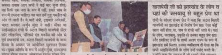
आईआईएम के एकेडमिक बिल्डिंग का उद्घाटन अर्जुन मुंडा ने किया

आपकी शिक्षा नेतृत्व करने वाली होनी चाहिए - केंद्रीय मंत्री अर्जुन मुंडा ने कहा कि आज हमें अपने अपने देश के लीडर हैं। अपने बहुत अच्छे लीडर मिल रहे हैं। बहुत अच्छा संस्थान मिल रहा है। हर लीडर को अपने अंतर्गत है, लेकिन साथ ही देशोत्साह का भाव भी होना चाहिए। अपने उदात्त चरित्र के साथ देश की भी जिम्मेदारी है। अपने लीडरों को अपने देश के देश के लीडर हैं। उनके लीडर से सीख लें। आपकी शिक्षा नेतृत्व करने वाली होनी चाहिए। वाजपेयी जी को झारखंड के लोग व यहाँ की जनजातों से बहुत प्रेम था रांची के लोग संभव हो तो क्या भी अटल बिहारी वाजपेयी का झारखंड से विशेष प्रेम था। ऐसा कोई देश था, जब वो रांची को आगे बढ़ाए। और इतिहास उनके के साथ अलग रूप के रूप में झारखंड हमें मिले। उनका व्यक्तित्व ही ऐसा था कि सभी आदिवासीओं के लोग उनके पास चले थे। उन्होंने कहा कि संभव है जो हमसे लोग पाएंगे पर देश बचता है, तब तक संभव नहीं नहीं चले, जब हमें कि हमें ही बचाने की होनी चाहिए। गुड गवर्नेस प्राचीन परंपरा की देन है ऐसा कहा ने कहा कि संभव हमारे प्राचीन परंपरा को देन है। हमारे विचारधारा से भी संभव है। हमारे सुध को भी निवेश है, ये भी संभव है कि निवेश है। वाजपेयी ने भी कहा कि वे ही हमारे को सुधार में मदद आए हैं।