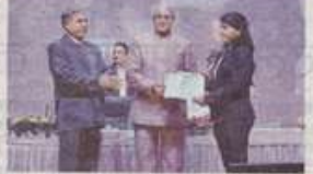
राज्यपाल ने लाइब्रेरी व हैप्पीनेस सेंटर का किया उद्घाटन। 4 फ्लोर की होगी हाइब्रिड लाइब्रेरी, 800 स्टूडेंट्स एक साथ करेंगे अध्ययन, हैप्पीनेस सेंटर में मिलेगी खुश रहने की ट्रेनिंग।

60.4 एकड़ में फैला है पुराना विद्यापीठ। 13वां फाउंडेशन डे मना, राज्यपाल रमेश वैस हुए शामिल, दी शुभकामनाएं। आईआईएम का 13वां फाउंडेशन डे मना, राज्यपाल रमेश वैस हुए शामिल, दी शुभकामनाएं।