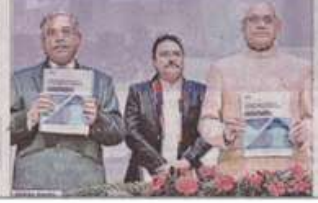
आईआईएम रांची का 13वां स्थापना दिवस समारोह का आयोजन किया।

आईआईएम सिर्फ प्रोफेशनल मैनेजमेंट ही नहीं, बल्कि अच्छे और जिम्मेदार इंसान बनाने की भी कोशिश करे : राज्यपाल छात्र दे सकते हैं झारखंड के विकास की ऊंचाई आईआईएम रांची का 13वां स्थापना दिवस समारोह का आयोजन किया।