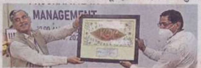
सिटी रिपोर्टर, रांची

पहले बैच में देशभर के 120 स्टूडेंट्स का एडमिशन हुआ