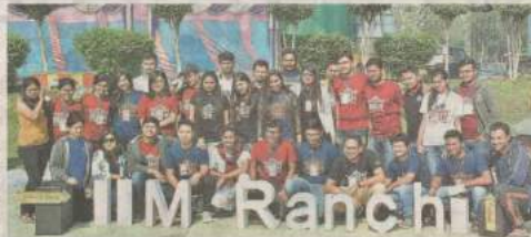
30 से ज्यादा इन्टर में किसमत आजमा रहे हैं खिलाड़ी.

देश भर के प्रबंधन संस्थान समेत स्थानीय 15 री खिलाड़ी आजमा रहे हैं किसमत