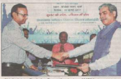
Chief minister Raghubar Das at the signing of MOU between state government and IIM, in Ranchi on Saturday.

Earlier, addressing the gathering after inaugurating the Deen Dayal Upadhyay Kaushal mega skill centre online here, Das said the priority of his government was to train and impart skills to the youths.