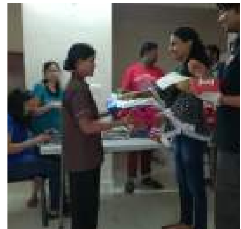
SAMARPAN TEAM DISTRIBUTING BLANKETS TO THE STAFF

Everyone gets a chance to bid for rare products and services which might not be available otherwise and in turn contribute for such a noble cause of lighting up a child's life that Diwali. The day was also lined up with lots of other fun activities like Painting, Rangoli Making, Crafts and Games.