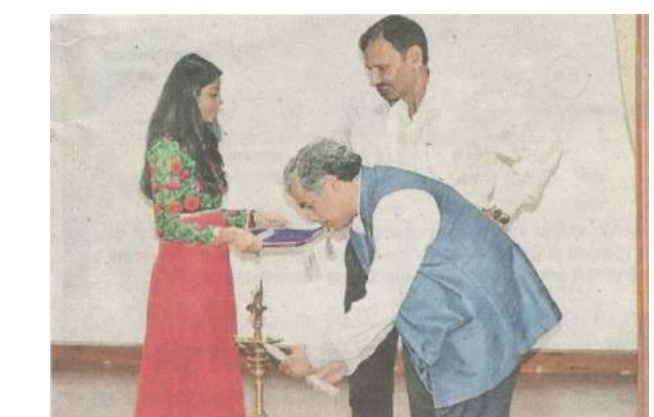
आइआईएम रांची में शिक्षक दिवस समारोह का आयोजन किया गया। इस मौके पर संस्थान में कई कार्यक्रमों का आयोजन किया गया।

दो दिवसीय खेलकूद और सांस्कृतिक उत्सव रश-3 का शुभारंभ आज शुरू हुआ। इस अवसर पर निदेशक ने खिलाड़ियों को टीम भावना से खेलने का निर्देश दिया। उन्होंने खेल और टीम भावना में प्रतियोगिता में हिस्सा लेने का आह्वान किया। उन्होंने खेल और टीम भावना में प्रतियोगिता में हिस्सा लेने का आह्वान किया।