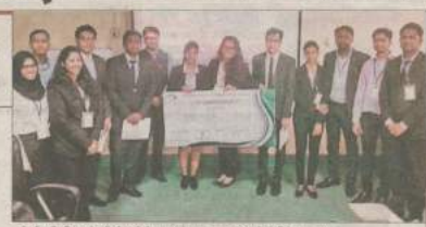
आइएम में एगॉन की शुरुआत में एक-दूसरे को मजे मजा-30 इंटर के विद्यार्थी। *मजेदार

आइएम के छात्रों ने फेस्ट की तैयारी के लिए अपने-अपने टीम बना दी थी। एगॉन में टीम बनाकर आइएम की विद्यार्थी, खेलों में एक-दूसरे को प्रतियोगिता देती, जिससे मजे मजा जाता है। आइएम में आइएम के विद्यार्थी भी एक-दूसरे को प्रतियोगिता देते हैं।