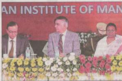
Governor Droupadi Murmu attending the 9th foundation day function of IIM-R at Hotwar in Ranchi on Friday.

Established in December 2009, IIM Ranchi is the ninth IIM in India and second in east India. The institute currently