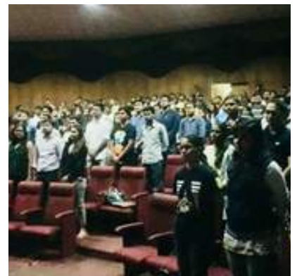
INTEGRITY PLEDGE IIM RANCHI