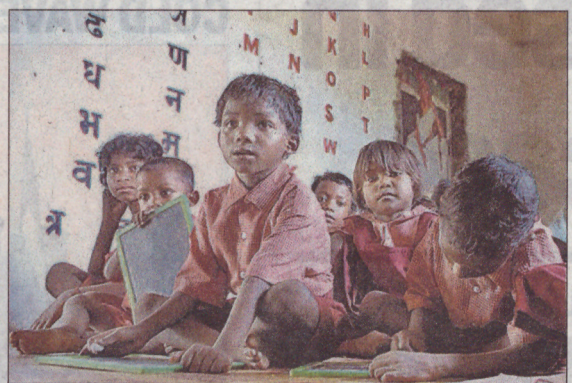
Students busy in a primary school class room in Jharkhand.

The reorganisation of primary schools benefited seven lakh students, giving them better teacher availability, and cut the requirement of 4,500 teaching positions. The merger process saved the government Rs 400 crore by reducing teaching positions and infrastructure requirements, said JEPC officials. The officials added that the funds thus saved would be spent on strengthening the education infrastructure of the merged schools.